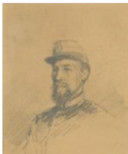
Portrait of Ștefan Fălcoianu. Engraving by Nicolae Grigorescu, Library of the Romanian Academy

There have been name changes and transformations, and the aforementioned words have accomplished their true meaning year after year.