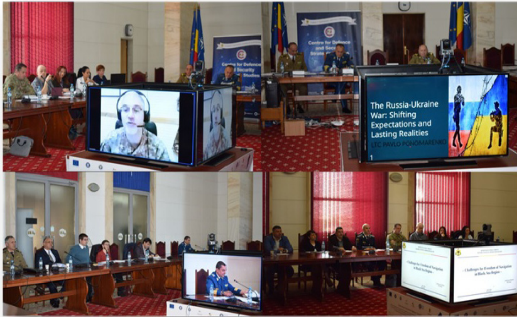
Photo: Aspect of the International Seminar

situation that had a profound impact on the international security environment, generating a large-scale military conflict in the Romanian vicinity. At the same time, the Commandant (Rector) conveyed to those present: “I strongly believe that the scientific event will constitute an opportunity for all of us to gain a better grasp of the solutions for today’s challenges and to develop new ideas regarding the effects on national, regional and international security. Their development may contribute to achieving success in training and conducting future warfare.”