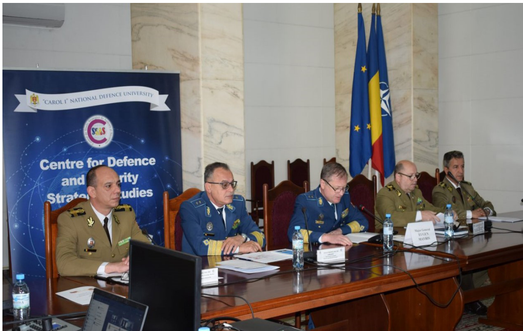
Photo: Aspect of the International Seminar