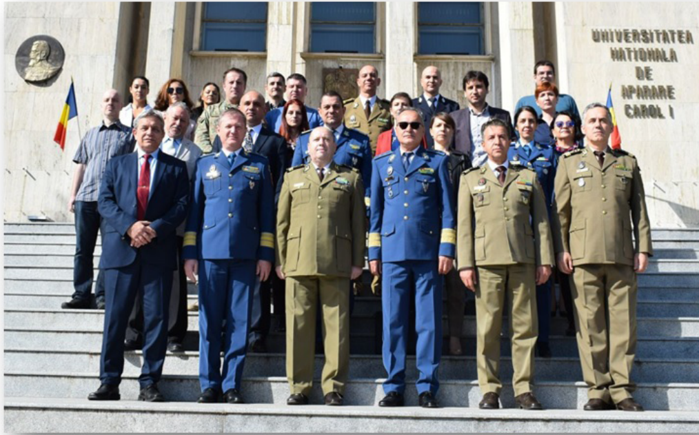
Photo: Aspect of the International Seminar

Command, Air Staff, Naval Staff, Training and Doctrine Directorate, Department for Defence Policy, Planning and International Relations, Regional Department of Defense Resources Management Studies), the Association of Reserve Officers from Romania, representatives of the National System of Defense, Public Order and National Security and, also, CDSSS research staff.