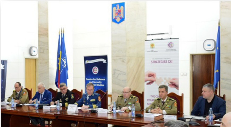
Photo: Aspect of the International Scientific Conference