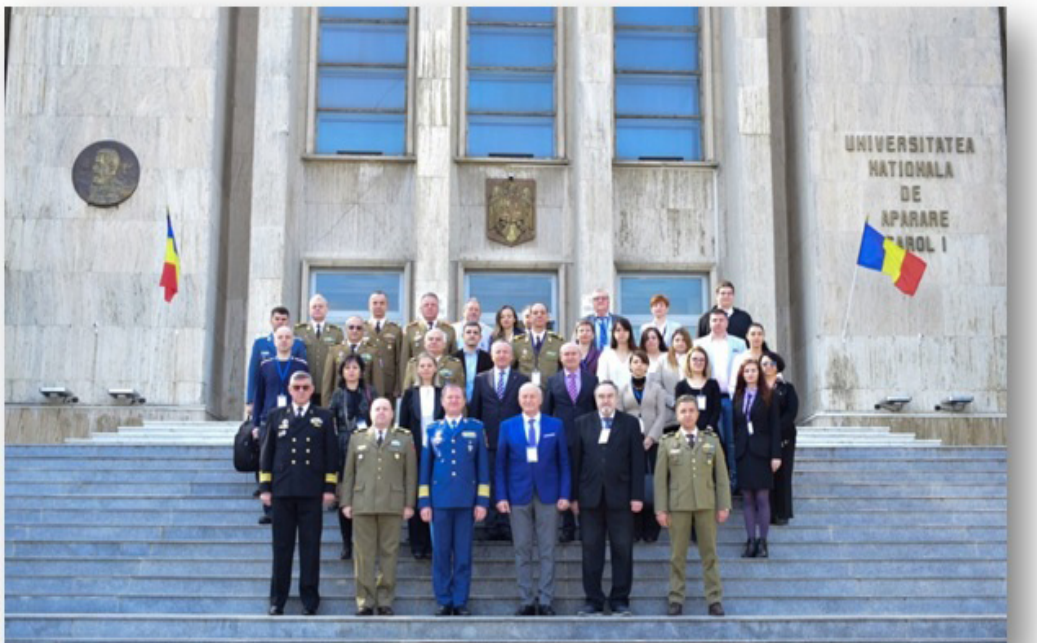
Photo: Aspect of the International Scientific Conference

The event created a framework in which the objectives of the 4EDU Reform/ Investment Project entitled “Integrated Educational Infrastructures for Smart Learning” were presented by the project manager Vice-Rector for Scientific Research and Interinstitutional Relations. The overall objective of the project is to transform “Carol I” NDU into a modern, flexible, environmentally friendly, nationally and Euro-Atlantic recognized educational institution, connected to the principles of digital education and meeting the demands of future generations of students. He also gave a lecture entitled “Digital Transformation. Challenges and Perspectives”, in which he highlighted the benefits of digitalisation in academia and the impact of these technologies.