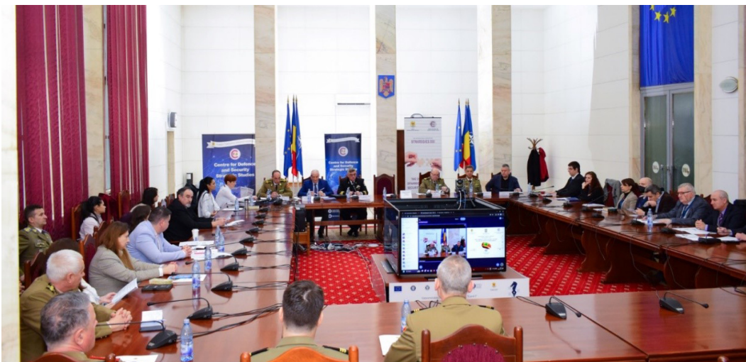
Photo: Aspect of the International Scientific Conference

This year’s edition of the International Scientific Conference STRATEGIES XXI , on the topic of the “The Complex and Dynamic Nature of the Security Environment” , organized on February 28, 2024 , by “Carol I” National Defence University (NDU), through the Centre for Defence and Security Strategic Studies (CDSSS), brought together in the Senate Hall participants from the national and international academic and research community, personalities with recognized expertise in the field of security, military personnel and specialists from the Defence Staff structures and institutions within the national defence, public order and national security system, members of the diplomatic community accredited in Bucharest, security and defence practitioners, MA and PhD candidates.