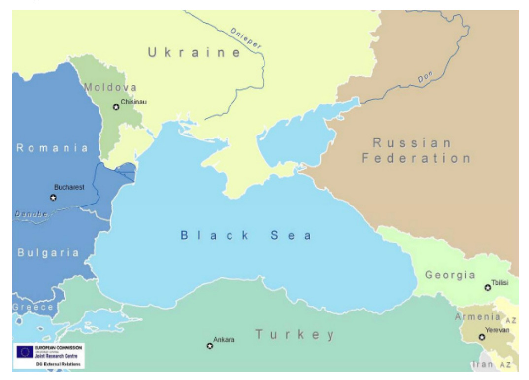
Figure no. 2 – The extended Black Sea region<sup>2</sup>

Among all the countries with access to the Black Sea, Romania stood out by far with its active military of its strategic importance, advocating for its inclusion in the objectives on the NATO and EU agendas. To support this, Romania's political-military representatives often brought into discussions as arguments the developments in the Pontic states and the role of the Black Sea as a link between Europe, Asia and the Middle East.